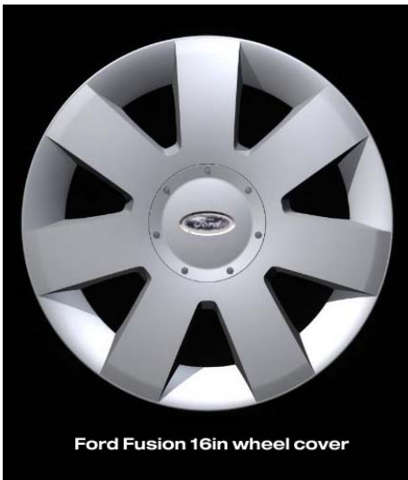
Ford Fusion 16in wheel cover

16" Steel Wheel w/Deluxe Wheel Cover Standard on I-4 SE & V-6 SE