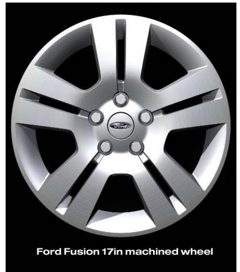
Ford Fusion 17in machined wheel

16" Aluminum Wheel Optional on I-4 SE & V-6 SE (643)